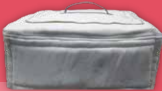
Slow Cool Box