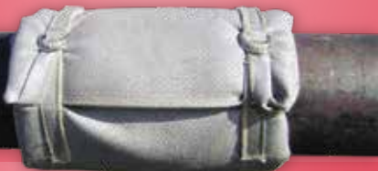
Slow Cool Pipe Wrap