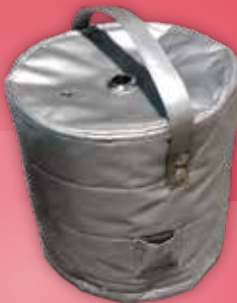
Slow Cool Can